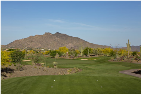
Click on Photo to see Video Flythrough of Model

Disclaimer: DM Builders 19 LLC/Cullum Homes reserves the right to change the above without notice. Prices are subject to change. See Purchase Agreement for details. A signed and executed Purchase Agreement will be the final Instrument of Agreement between DM Builders 19 LLC and the Home Buyer. Sales and Marketing provided by The Grigg’s Group of Realty Executives.